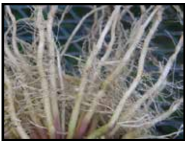
Capture LFR insecticide

Beyond protection against corn rootworms and seedling soil pests, the addition of VGR Soil Amendment helps build bigger, fuller roots for maximum water efficiency.