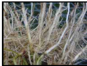
Capture LFR insecticide + VGR Soil Amendment