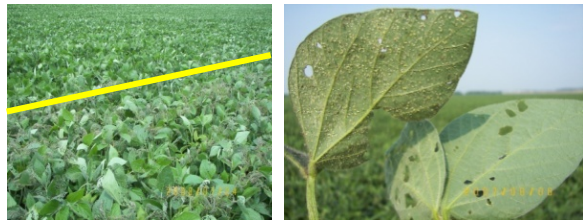
Untreated vs. Mustang® Maxx Insecticide - 26 DAT